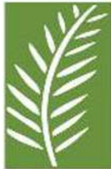
Palm Sunday March 24 th 8am & 10:30am

Prayerfully consider attending as many worship services as you are able.