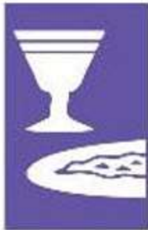
Maundy Thursday March 28 th 7pm